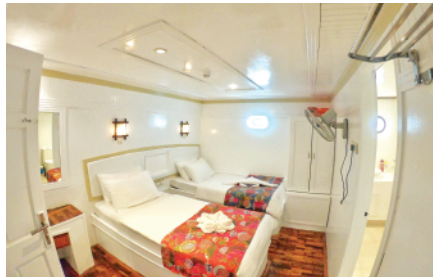
08 Standard Cabins

Maldives Legend II can accommodate a maximum of 24 guests in 12 cabins. All Cabins are equipped with airconditioned and hot and cold shower. All Seaview Suites have minibar and hairdryer available. There are a total of 3 seaview suites and 1 seaview cabin on the upper deck. All Seaview suites are equipped with king sized beds and two of them can be converted to a twin cabin. The seaview standard cabin has a bunk bed cabin. All Standard Cabins are on the lower deck. 2 of the seaview cabins are double bed cabins. 1 Seaview Cabin is equipped with a king sized bed. 5 Seaview Cabins have twin accommodation with 2 single beds.