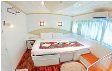
03 Seaview Suites & 1 Seaview Cabin